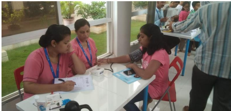
Vijaya Shrushti Camp