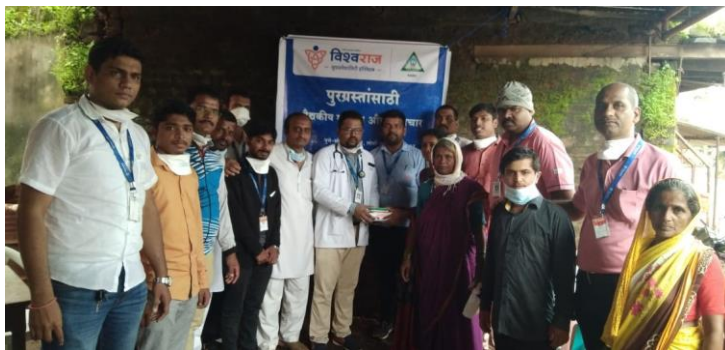
Kolhapur Camp- Initiative to provide helping hand and free health services for Flood Affected Community