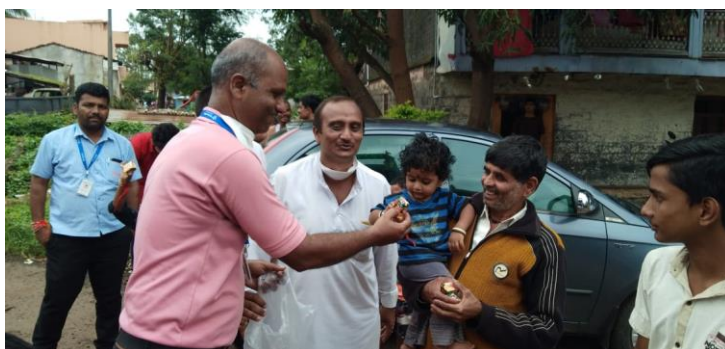
Kolhapur Camp- Initiative to provide helping hand and free health services for Flood Affected Community