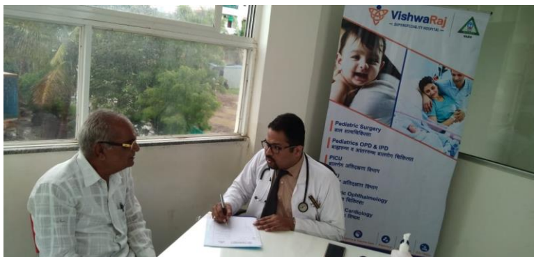
Vijaya Shrushti Camp