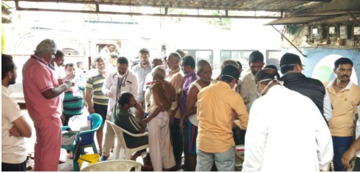
Kolhapur Camp- Initiative to provide helping hand and free health services for Flood Affected Community