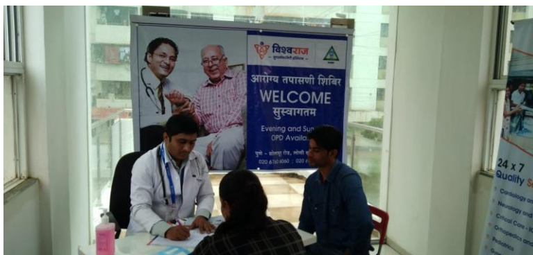
Vijaya Shrushti Camp