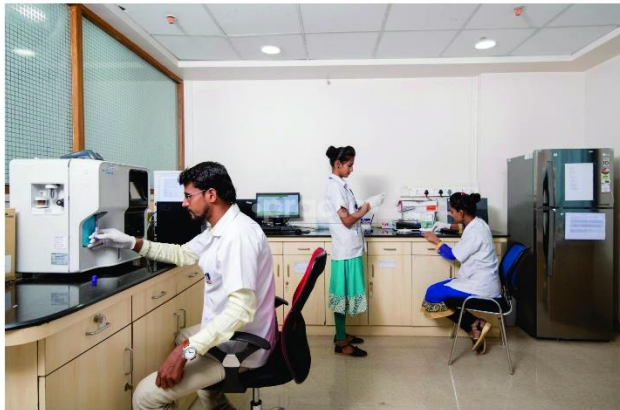
Other Facilities : X-Ray,MRI,CT-Scan,USG,2D Echo